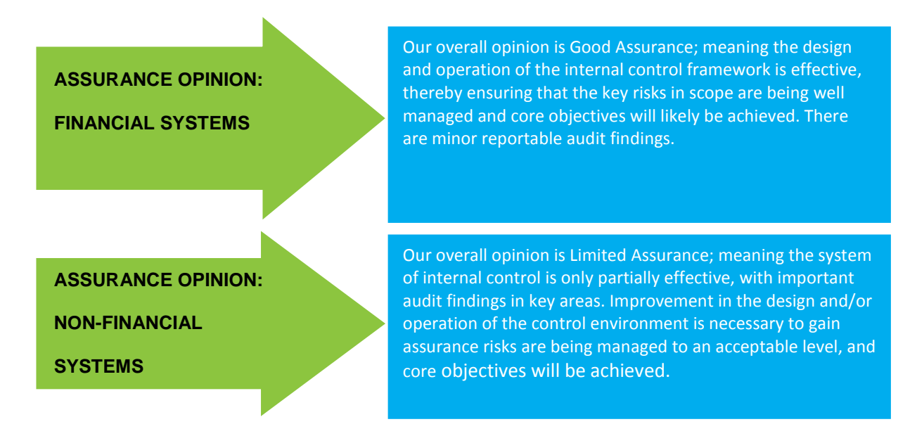
Note: When considering these opinions it should be noted that in 2018/19 the SIAS moved from a five tier assurance opinion matrix (Full, Substantial, Moderate, Limited and No Assurance) to one that contains four tiers (Good, Satisfactory, Limited and None).

governance arrangements, encompassing internal control and risk management, by completing an annual risk-based audit plan. From the internal audit work undertaken in 2018/19, the SIAS can provide the following assurance on the adequacy and effectiveness of the Council's control environment, broken down between financial and non-financial systems as follows: